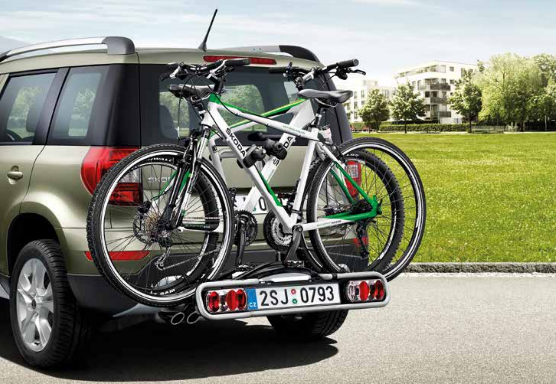
Bicycle carrier for a tow bar can hold two bicycles weighing up to 25 kg each. Lockable bolts permit flexible handling and better anchoring (000 071 105B)