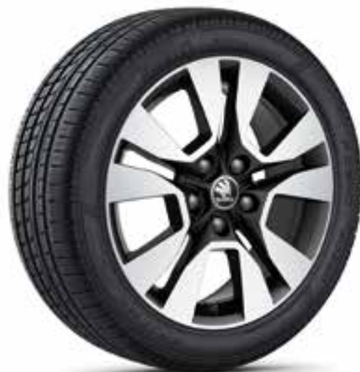
Origami light-alloy wheel 7,0J x 17" for 225/50 R17 tyres in black design, brushed (5L0 071 497K FL8)