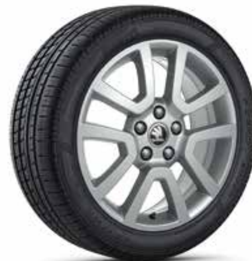
Spitzberg light-alloy wheel 7,0J x 17" for 225/50 R17 tyres in silver design (5L0 071 497F 7ZS)