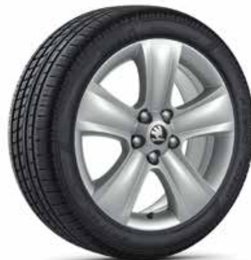
Dolomite light-alloy wheel 7,0J x 17" for 225/50 R17 tyres in silver design (5L0 071 497G 7ZS)