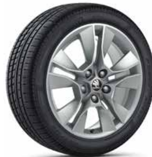
Blossom light-alloy wheel 7,0J x 17" for 225/50 R17 tyres in silver design (5L0 071 497A 8Z8)