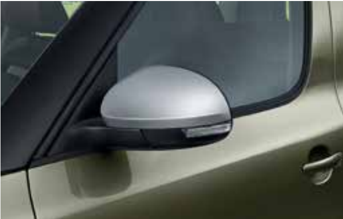
Side mirror covers – aluminium look When purchasing a Yeti vehicle you can decide between three designs of side mirror covers. The basic black variant can be replaced with covers in the colour of the body, or in silver with an aluminium look. Silver mirrors are standard for the Yeti Outdoor model (5L0 071 719)