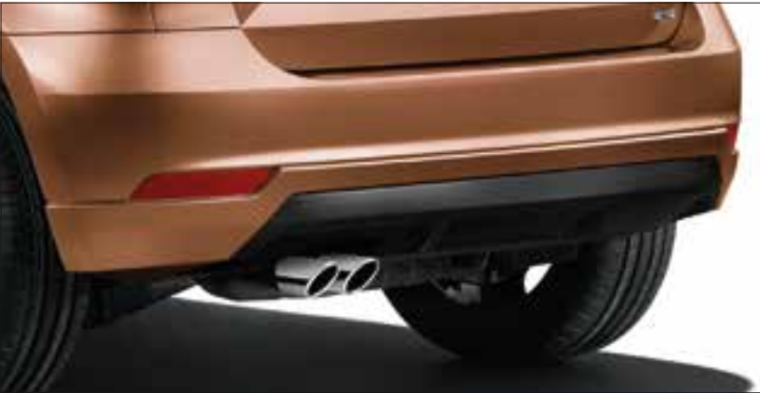
Rear spoiler In combination with the front spoiler, it helps the Yeti to fulfil its sporty ambitions (5L6 071 610 for cars without serial preparation for the tow bar; 5L6 071 610A for cars with serial preparation for the tow bar)