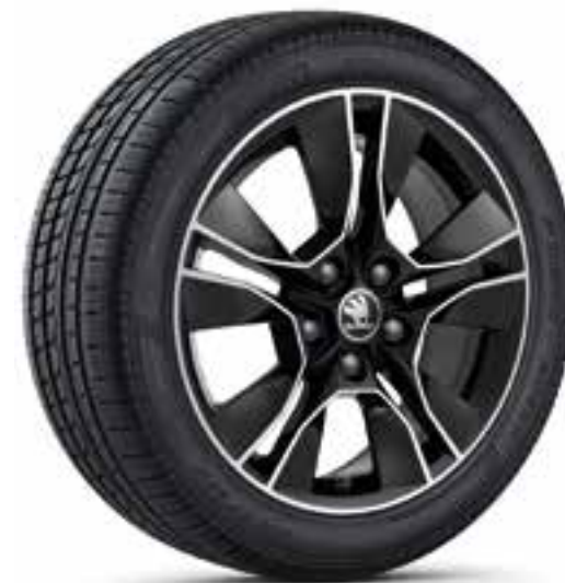
Blossom light-alloy wheel 7,0J x 17" for 225/50 R17 tyres in glossy black design, brushed (5L0 071 497A JX2)