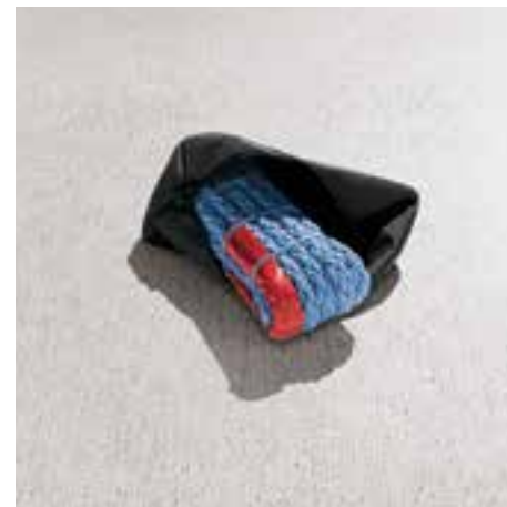
Tested tow rope permits towing of vehicles weighing up to 2,500 kg (GAA 500 001)