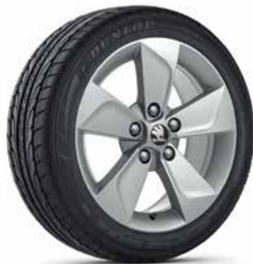
Nevis light-alloy wheel 7,0J x 16" for 205/55 R16 and 215/60 R16 tyres in silver design (5L0 071 496A 8Z8)