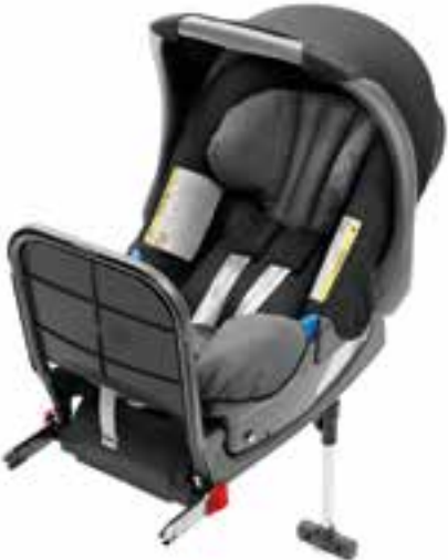
Baby-Safe Plus child seat (1ST 019 907)