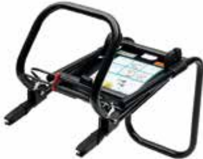
RWF frame for rear-facing fitting (DDF 000 003A) No photo: FWF frame for forward-facing fitting (DDF 000 002)