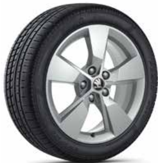
Erebus light-alloy wheel 7,0J x 17" for 225/50 R17 tyres in silver design (5L0 071 497J 8Z8)