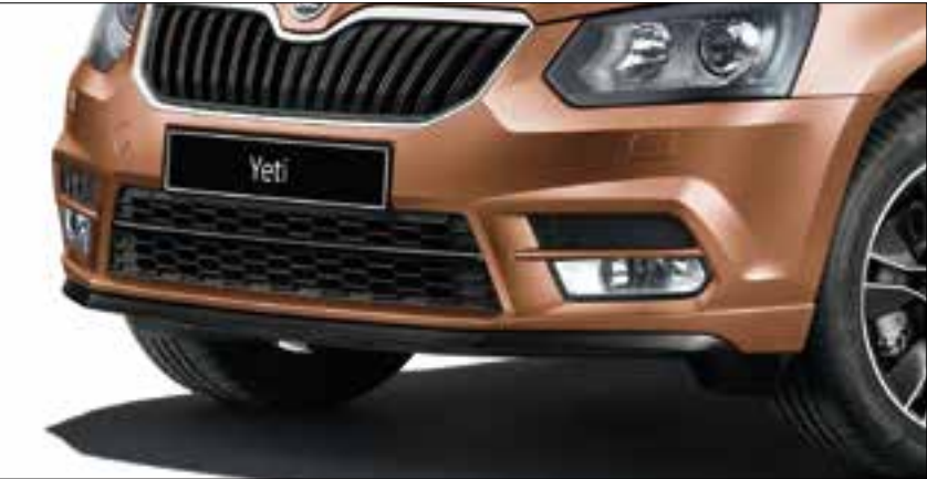
Front bumper spoiler for a sportier appearance at the vehicle's front(5L0 071 609)