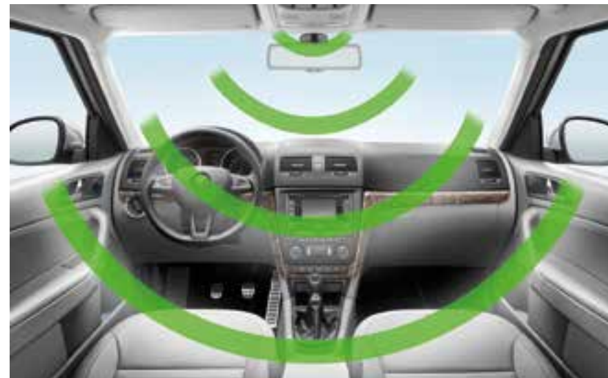
Alarm system with interior monitoring is equipped with advance resource to ensure the system's functionality after disconnecting the battery. Activates automatically after locking the car and monitors all doors, engine lid, ignition switch and vehicle interior. If there is an unallowable interference, control unit launches all directional lights and siren. Audio alarm lasts 25 seconds and can be induced repeatedly up to 10 times in a row. Basic alarm kit for cars with serial remote control of central locking (BKA 700 001); basic alarm kit for cars without serial remote control of central locking (BKA 700 002); mounting kit for alarm (BKA 630 001)