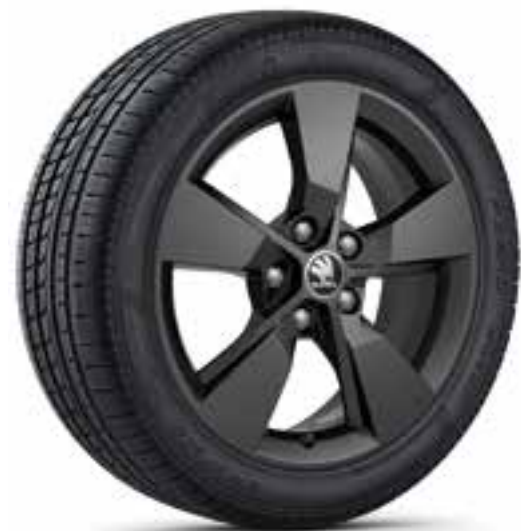
Erebus light-alloy wheel 7,0J x 17" for 225/50 R17 tyres in black metallic design (5L0 071 497P FL8)