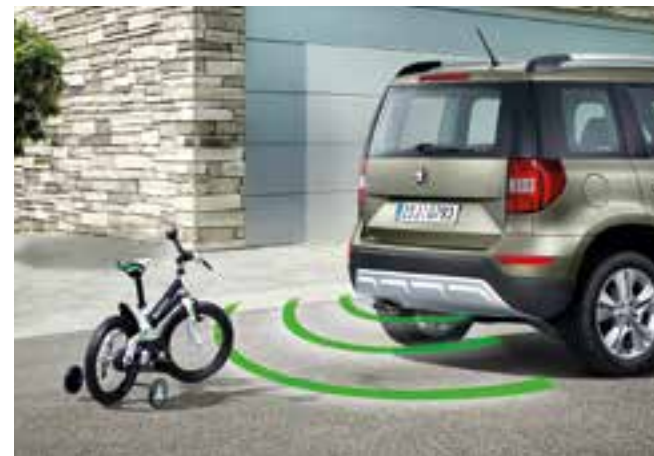
Rear parking sensors for monitoring distance of vehicle from potential obstacles. If there is an obstacle at a distance of 140 cm from the rear of the car, it is signaled by short beeps at intervals of one second. This interval is continuously shortened with the approach to the obstacle. When approaching 30 cm, beeps turns into unbroken tone (BKA 600 003A)