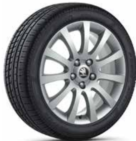
Annapurna light-alloy wheel 7,0J x 17" for 225/50 R17 tyres in silver design (5L0 071 497C 7ZS)