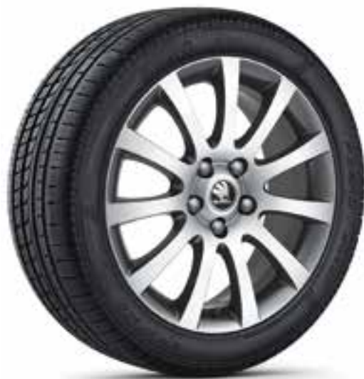
Annapurna light-alloy wheel 7,0J x 17" for 225/50 R17 tyres in anthracit design, brushed (5L0 071 497E HA7)