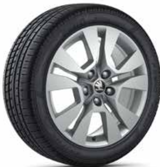
Origami light-alloy wheel 7,0J x 17" for 225/50 R17 tyres in silver design (5L0 071 497L 8Z8)