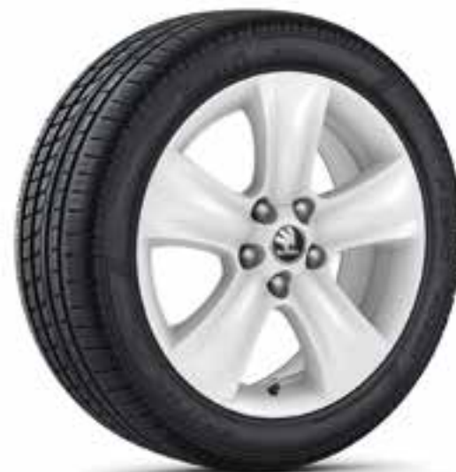
Dolomite light-alloy wheel 7,0J x 17" for 225/50 R17 tyres in white design (5L0 071 497N FM9)