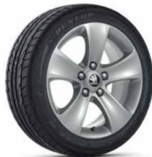
Moon light-alloy wheel 7,0J x 16" for 205/55 R16 and 215/60 R16 tyres in silver design (3T0 071 496A 7ZS)