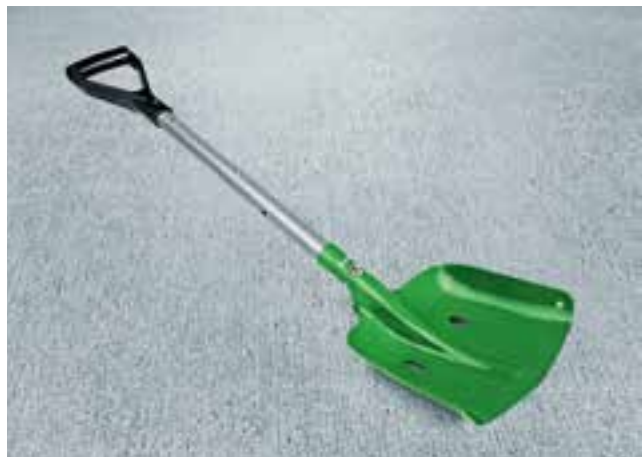
Foldable snow shovel made of alloy, weight 750 g, 3-part, including practical textile cover (5L0 099 320)