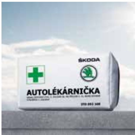
First aid kit with contents conforming to amended Decree No. 216/2010 (GFA 410 010DE)