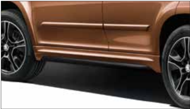
Side doorsill covers Sturdy doorsill covers for even more dynamic look of your Yeti (5L0 071 685A)