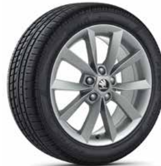
Scudo light-alloy wheel 7,0J x 17" for 225/50 R17 tyres in silver design (5L0 071 497M 8Z8)