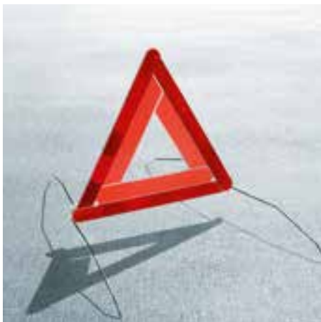
A handy, stable and highly visible warning triangle with foldable metal feet for emergency use on the roadway (GGA 700 001A)