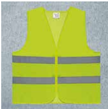
Lightweight reflective safety vest of 100% polyester in fluorescent yellow colour comes in a textile carrier. An important part of the vehicle's safety equipment (3T0 093 056); offered also in orange colour (XXA 009 001)