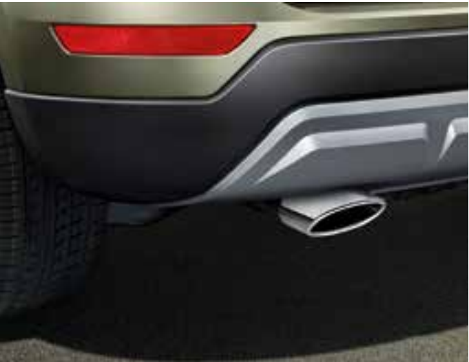
Stainless steel exhaust tailpipe For 1.4 TSI and 2.0 TDI CR 81 kW/103 kW (5L0 071 911A)