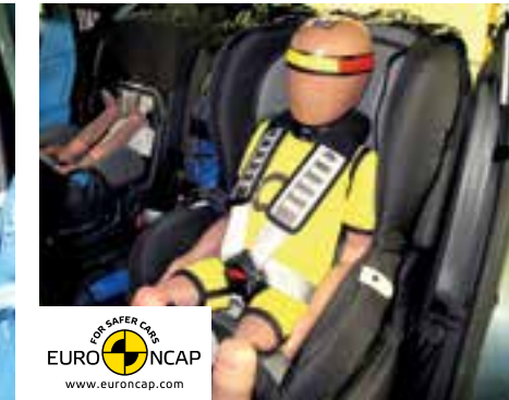
Original ŠKODA child seats successfully passed the Euro NCAP tests.