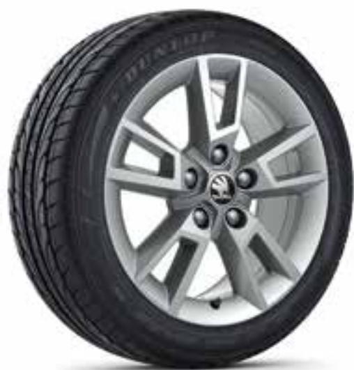
Forrest light-alloy wheel 7,0J x 16" for 205/55 R16 and 215/60 R16 tyres in silver design (5L0 071 496B 8Z8)