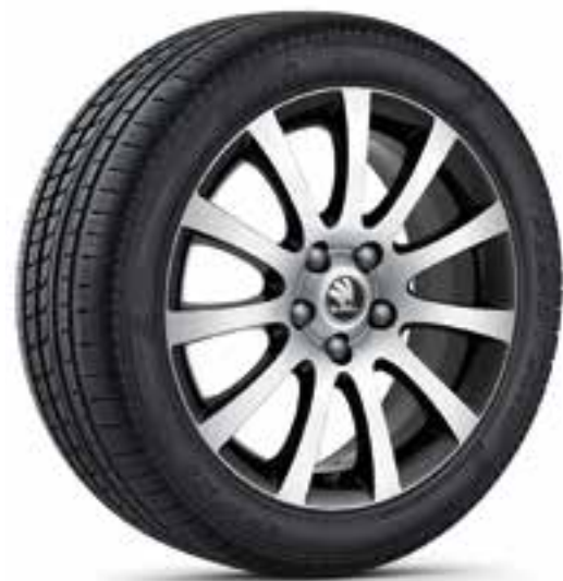
Annapurna light-alloy wheel 7,0J x 17" for 225/50 R17 tyres in glossy black design, brushed (5L0 071 497D JX2)