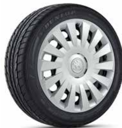
Nordic hub covers for wheels 6,0J x 16" 4-piece set (5E0 071 456)