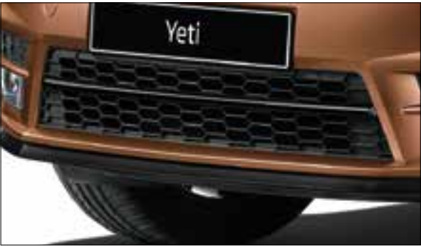
Decorative front spoiler strip A strip lacquered in the vehicle's colour for a stylish addition to the vehicle's visage (5L0 071 004A)