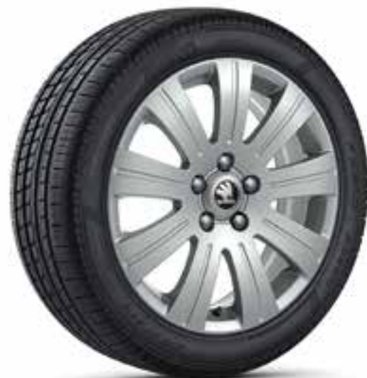
Flash light-alloy wheel 6,0J x 17" for 205/50 R17 tyres in silver design (5E0 071 497B 7ZS)