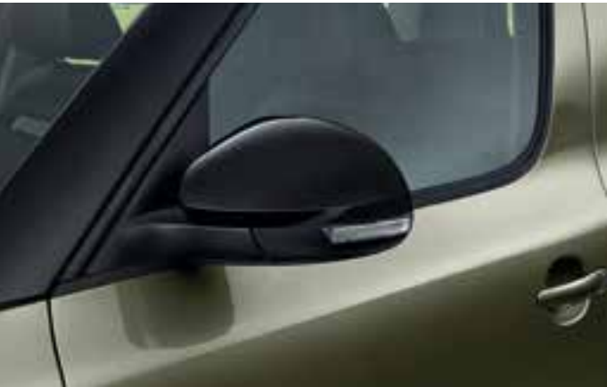
Side mirror covers in black design Side mirror covers in black metallic design (5L0 072 530)