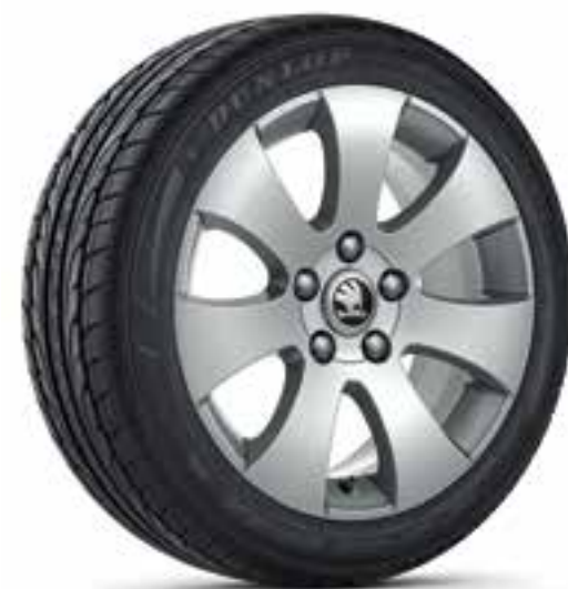
Spectrum light-alloy wheel 7,0J x 16" for 205/55 R16 and 215/60 R16 tyres in silver design (3T0 071 496 7ZS)