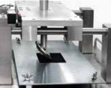
Device for high-heel test Fixing elements strength testing

Rubber foot mats with raised edge 4-piece sets; for left-side driving (5L1 061 550A; for right-side driving 5L2 061 550A)