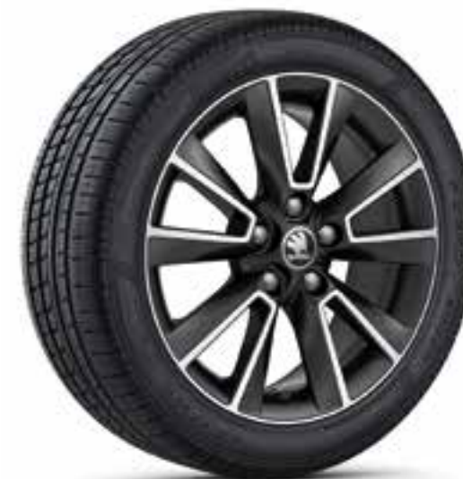
Matterhorn light-alloy wheel 7,0J x 17" for 225/50 R17 tyres in glossy black design, brushed (5L0 071 497H FL8)