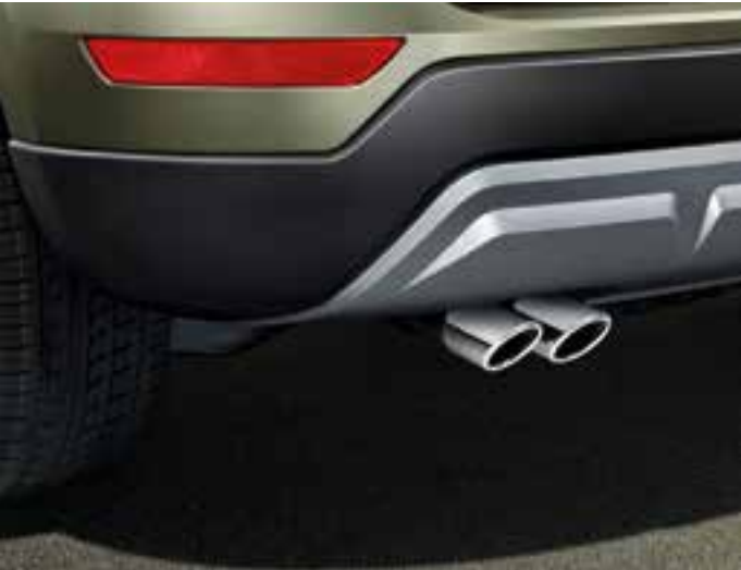
Stainless steel exhaust tailpipe This will make the rear of your Yeti shine like a jewel. The high-quality material will also provide the tailpipe with excellent protection against corrosion. For 1.2 TSI (5L0 071 910A)