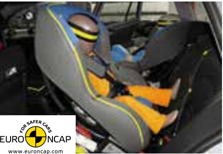
Original ŠKODA child seats successfully passed the Euro NCAP tests.