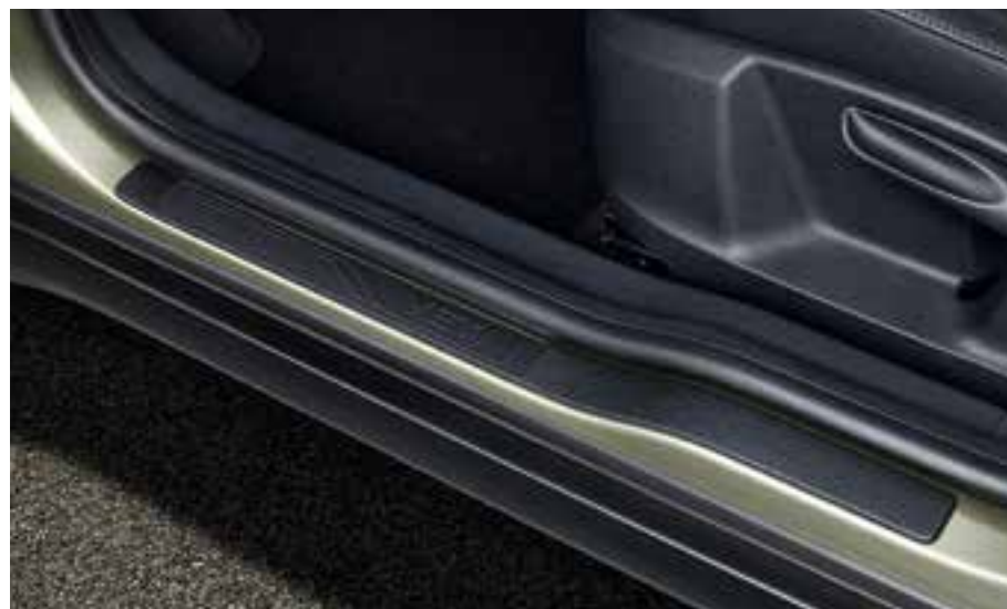
Black door sill covers Protection for your Yeti; door sill covers with stylish Yeti sign, protect surfaces of sills and simultaneously individualize the look of your car (5L0 071 303A)