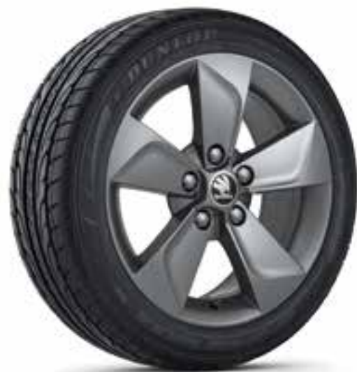
Nevis light-alloy wheel 7,0J x 16" for 205/55 R16 and 215/60 R16 tyres in anthracit design (5L0 071 496N HA7)